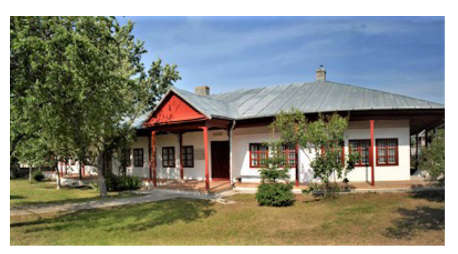
Fig.12. Costache Negri mansion from the locality of the same name, Galați county

In the first half of the 19th century, in the Galati county, the process of transition from the stage of the natural economy to that of commercial relations took place, animated equally by merchants, but also by the owners of estates or peasants. Within the estate there are some transformations, the most important of which are the increase of days of work and the extension of the property, by different means, some of which were rather forceful, because the arable lands near Galati, and here we consider the land of Tecuci and Covurlui, part of modern day Galați County, produced much higher revenues, compared to those in Northern Moldova. For example, in the land of Covurlui, the wheat culture brought a profit of 361 piastres for a sickle, unlike in lasi, or Suceava where 79 piastres were barely