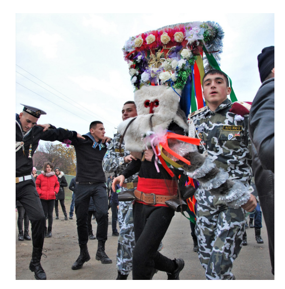
Fig.23. The traditional festival "Moșul", Orlovka village, Reni

the human experience can be observed here. On the other hand, this region is characterized by a high degree of mobility of representatives of different peoples and even of cultural practices. Such regions are usually referred to as the "lands between". The originality of each community of the Reni region is visible from a comparative perspective that would include only them, as part of this region, and the broader ethnic-cultural frame form outside of it.