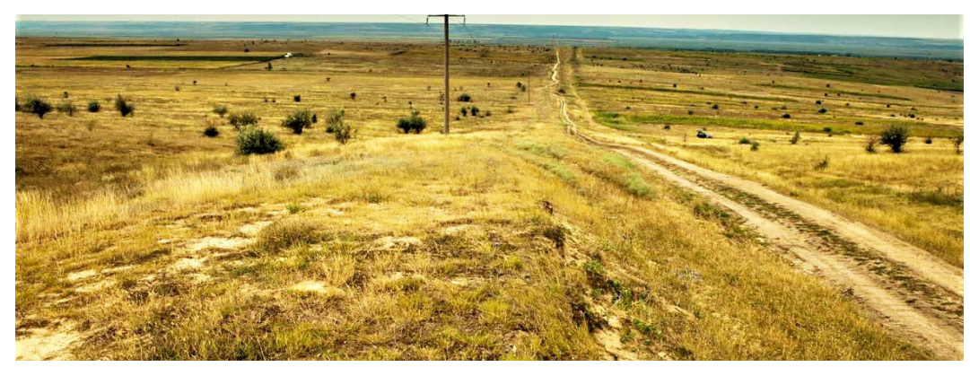
Fig.6. "Valul lui Traian" near Vadul-lui-Isac village