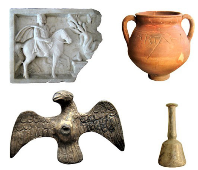
Fig.5. Dacian and Roman objects from the Bărboși Castrum, Galați County

On the other hand, the local evolution of the Geto-Dacian cultures in the Lower Danube region, with a pronounced genetic essence and strong catalytic reactions, being in close relations with the surrounding civilizations, Greek, South Thracian, Scythian, Celtic and Roman, have given to this geographical area a specific color, showcased also by the archeological discoveries from Galati County from Poiana on Siret, Rates near Tecuci, Brăhăsesti, Bărbosi. The presence of the Geto-Dacians in the current space of Cahul district is demonstrated by unfortified Getic settlements discovered near the localities of Gotești, Lărguța, Cucoara. On the southwest territory of Prut-Dniester there were numerous Geto-Dacian settlements, the traces of which were discovered on the place and near modern villages: Manta, Văleni, Zărnești, Gotești, Filipeni, Sărățeni, Tigheci, Cazangic etc. Most of the settlements were situated near rivers and lakes, and the water was used for irrigation and household chores. Large settlements, of urban type, were few, but the population maintained commercial connections with the townspeople of the ancient Greek colonies of the North Pontic and of the later Roman cities. The names of the settlements of the natives have often remained unknown because no documents have