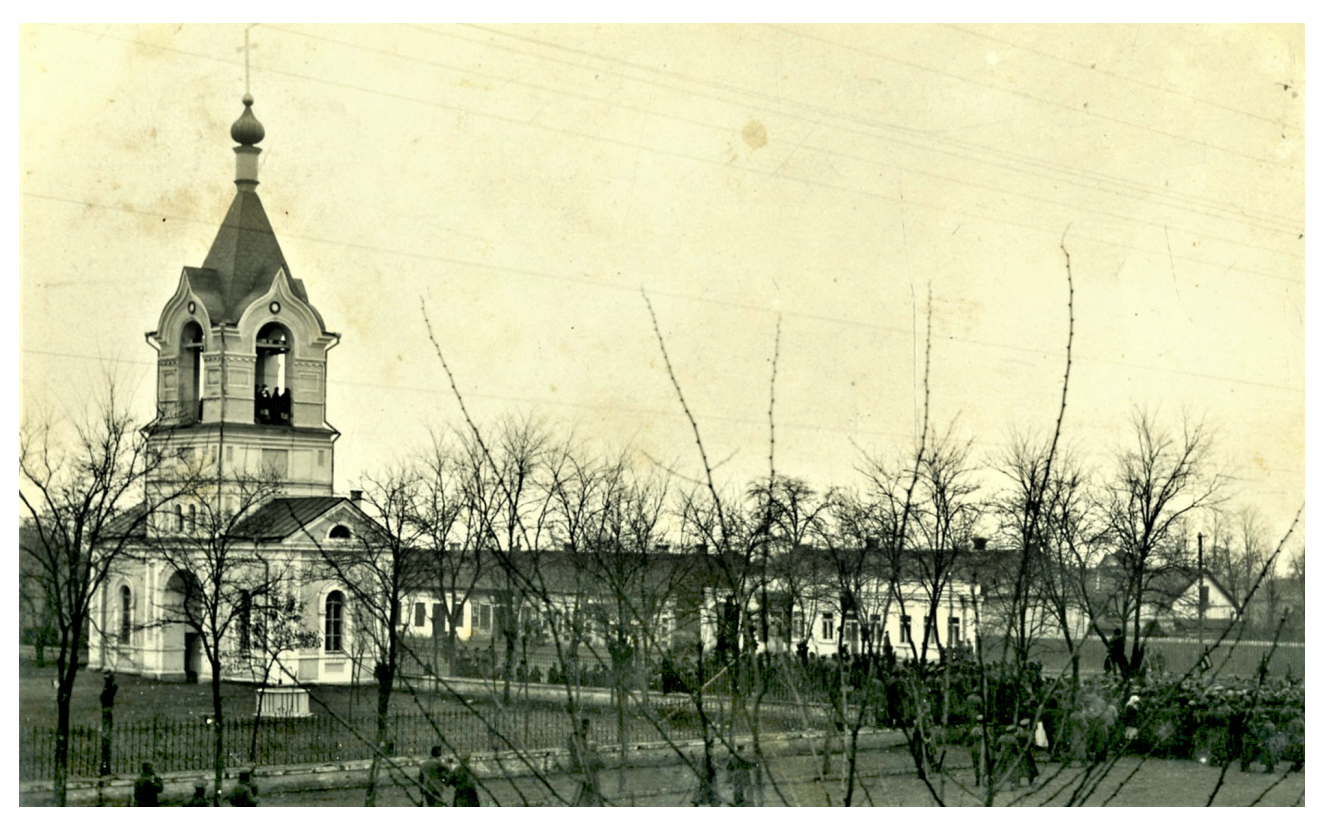
Fig. 14. Cathedral of the Holy Ascension from Reni, 1883

On the Prut and the Danube, the barges transported to Reni and Galați everything that the Bessarabian peasant produced: cereals, honey, cheese, fruits, vegetables. According to some statistics, in the period 1928-1936, 53,996 grain wagons were transported on the Prut by barges from the ports of Cahul and Leova, the maximum transports being performed in the years 1929 - 8,400 wagons, 1932 - 8,461 wagons, 1934 - 8,189 wagons. The exploitation of ponds, through the production and marketing of fish, was an important source of income. Between 1932 and 1936, about 1,5 million kg of fish were