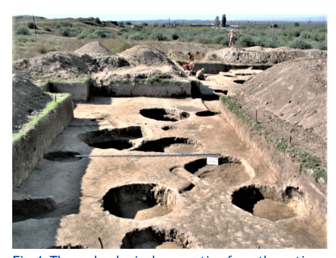
Fig.4. The archeological excavation from the antique settlement nearby Orlovka village, Reni