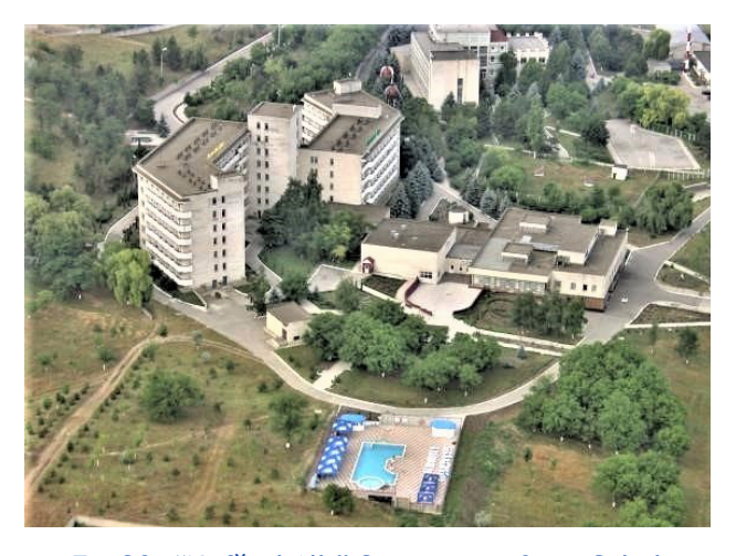
Fig. 20. "Nufărul Alb" Sanatorium from Cahul

The Cahul District is the organizer of several local, national and international festivals, among which the following can be mentioned: "Festivalul Internațional "Nufărul Alb" (The White Lotus International Festival) held in Cahul, promotes artistic groups of dance and song lovers, which present the developed, stylized or reconstructed folklore of the country they come from. The international festival "Chipuri de prieteni" (Faces of friends) which promotes young music performers from various countries and which takes place annually at the end of June. The international festival "Dulce floare de salcâm" (Sweet acacia flower) is organized in the Văleni village, the main activities that take place at the festival are: ethno-folk performances, exhibitions of works of folk craftsmen, preparation of traditional dishes, fair of agricultural products, educational activities for children. festival-contest "La vatra horelor bucuriene" (At the heart of the horas) is organized in the village of Bucuria and aims to promote folk song and dance and promote the creation of folk craftsmen. "Sărbătoarea roadelor" (the harvest Festival) is organized annually by the Cahul District Council. During the celebration take place exhibitions of professionals in the field of agriculture, viticulture and bakery, farmers, businessmen in the fields related to agriculture and exhibitions of folk craftsmen, as well as concerts with the participation of artistic groups from the district.