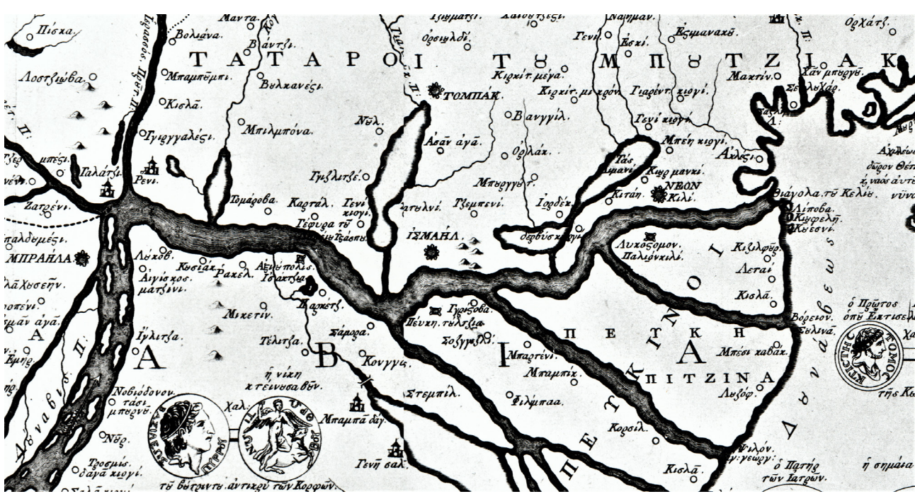
Fig.7. The Lower Danube Region on a Greek map from 1797

Socio-economic development from the VI-X centuries on the territory of the Galaţi county was stimulated by the presence of Slavic tribes. These, being in the stage of organizing "zdaruga", were assimilated by the local population that reached the stage of transition to feudalism. Numerous elements of the local, extra-Romanian material culture from the IX-X