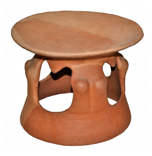
Fig.3. "Hora from Berești" (Cucuteni culture), Galați county

The pottery and the forms of the North-Pontic steppe vessels traditionally keep elements of technological essence, as well as stereotypical canons, specific to the craft of pottery, and the mastery of the decoration of the vessels, with bichrome, trichrome or incised painting, having a great volubility and artistic power of expression. The anthropomorphic and zoomorphic clay figurines are not inferior either, proving the same art in handling and processing clay. Hut-type dwellings and surface dwellings are distinguished by their specific architectural style, with walls made of a wooden skeleton, made up of poles and twigs, interspersed with thick forks that were buried on the edge of triangular-shaped floors or platforms. Beyond ceramic vessels with painted spirals, beyond anthropomorphic and zoomorphic figurines,