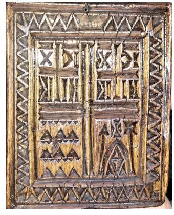
Fig.22. Fragment of a rural art exhibition, the museum from Novoselskoe, Reni

As for the Reni territorial community, which largely overlaps the triangle formed by the Danube Chilia branch and the Kugurlui-Ialpug lake system, and to north by the "Trojan walls", it is a unique historical and ethnographic region. On the one hand, the relict and conservative nature of the native population and a certain stability in the reproduction of