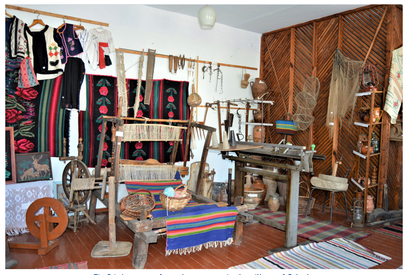
Fig. 24. Inventory from the museum in the village of Orlovka

The strongest ethnic group in the Reni region are the Moldovan Romanians. They have kept almost all the signs of their originality: language, cultural and everyday traditions, historical memory and identity. In both urban and rural