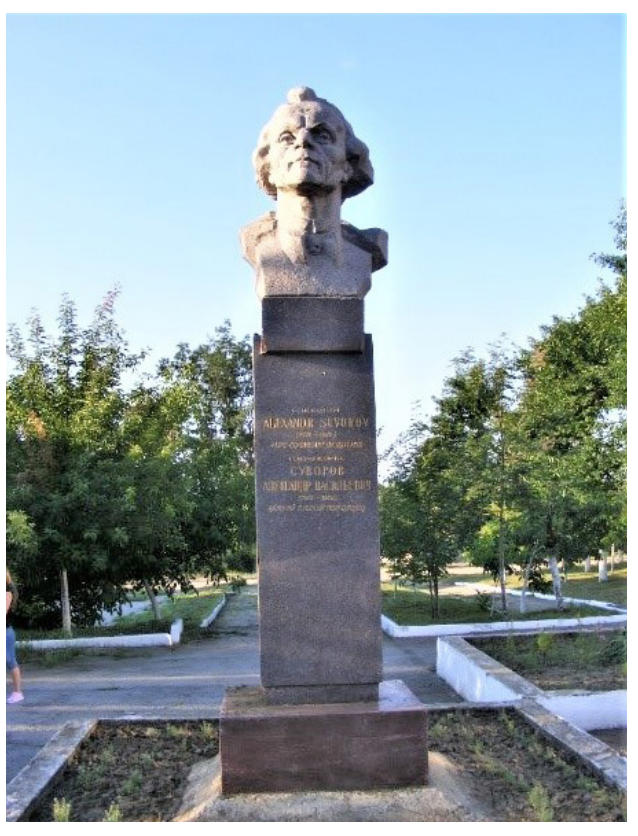
Fig. 10. Bust of A.V. Suvorov from Cahul

The churches, founded either by the voivodes (the only princely church left standing is in the city of Galați - the Mavramol church, was founded by Gheorghe Duca), or by those with positions in office, or by merchants (the church founded by the logothete Costache Conachi, Țigănesti, the church of the Adam monastery, founded by the serdar Adam Movilă, the churches "Sf. Nicolae-Banu", "Nasterea Maicii Domnului" (Birth of the Virgin mary) - Negustori