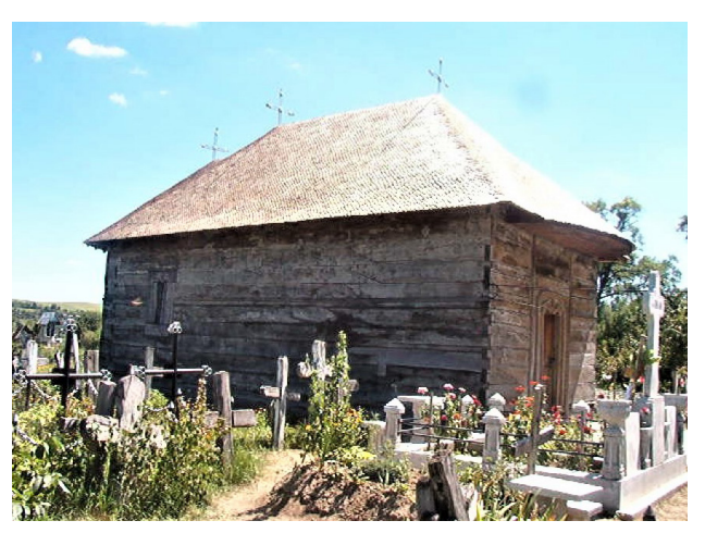
Fig.18. The wooden church from Cerțești, Galați county