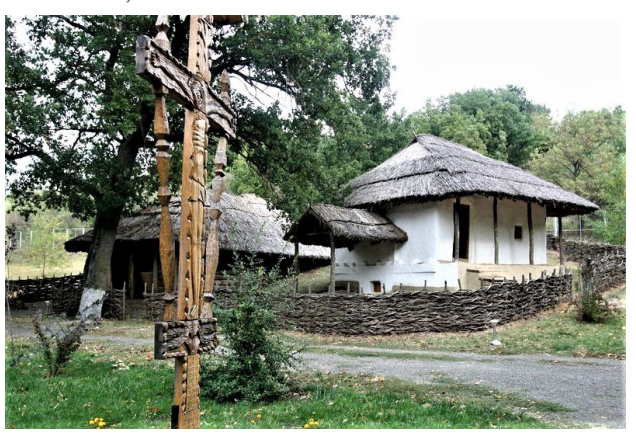
Fig.15. The museum of the "Petre Caraman" village from Gârboavele Forest, Cahul County

The unfolding of the events of World War II brought some European countries, including Romania, under the hegemony of Soviet Russia. After 1947, under the new political regime, there was a substantial change in all aspects of political, economic and social life. In the attempt to standardize the social layers, the nationalization of economic and commercial properties takes place, the economy becomes owned by the state, the imposed economic policy being centralized. The workshops and small factories are abolished, their place being taken by the industrial giants distributed, in a planned way, all over the country. Galați County was designated, after long national and even international disputes, as the site for the construction of the largest steel production complex in the country, which would transform the city of Galați, from a mercantile into a working-class city (the number of workers was, at one time, 37,000) through a formidable migration of peasants and workers from other parts of the country to Galati. In 1961, the foundation stone of the largest plant was set, with over 12,000 workers, engineers, technicians participating in its construction on Smârdanului Hill, being separated from the territory of Galați only by the Calicei valley, now Filesti, and the Cătusa brook. With the