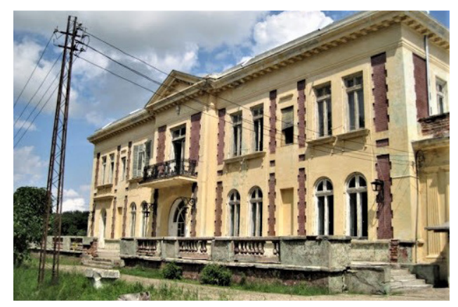
Fig.13. Chrissoveloni Palace from Ghidigeni, Galați County

For several decades, the city of Galati has also played the role of the main port of Romania, the government allocating significant sums for the construction of modern port constructions: docks and grain silos, works of the great engineer Anghel Saligny. The growing industrialization of the city attracted a larger number of people from all neighboring territories of the county, including Ukrainians and Russian-Lipovans. The number of public schools increases, so that almost every commune in the county had one or two primary schools, secondary ones being established in the town of Tecuci and Galati. After southern Bessarabia was annexed by Russia in 1878, the Normal School of Teachers moved from Ismail to Galați, as did the "Dunărea de Jos (Lower Danube)" Episcopate. Some of the teachers and priests came to Galați, to continue practicing.