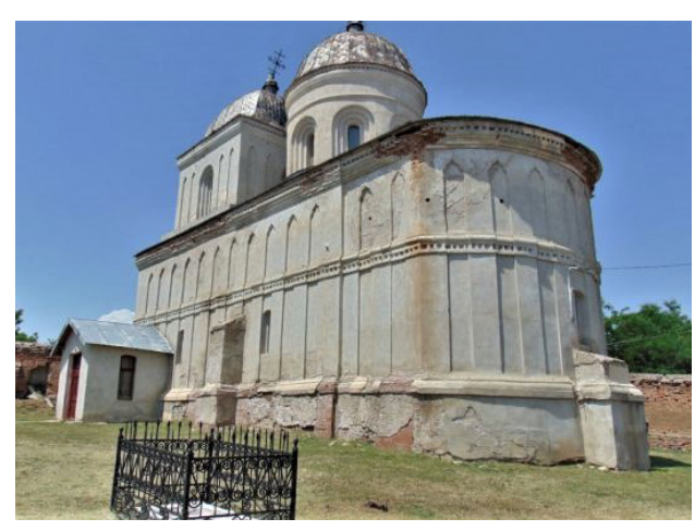
Fig. 17. The church "St. Nicolae"-Banu from Nicorești, Galați County

The churches of the Bulgarian or Russian-Lipovan communities are not inferior either. These communities have been preoccupied since the second half of the 19<sup>th</sup> century with the construction of their own places of worship (Galați). Many of the private schools, or the public ones from the end of the 19<sup>th</sup> century,