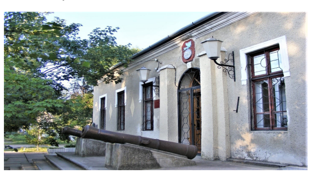
Fig. 19. The Cahul Museum

The famous vineyards of Galati County are in Ivești, Nicorești, Buciumeni, Adam, Târgu Bujor, Oancea can join together to form a road of vineyards and wine, just as they mark the few still standing old mansions. The linden forests from Buciumeni, the acacia forests and the sand dunes from Hanu Conachi or the peony reservation from Roscani together with the Prut or Siretului meadow complete the tourist, recreation and sports repertoire of the Galati county. The interweaving of the few millennia of human existence on this territory, in symbiosis with the elements that nature, in its generosity, has created over millions of years, is a geographical, historical and cultural framework that must be preserved, maintained and capitalized from an educational, and touristic point of view.