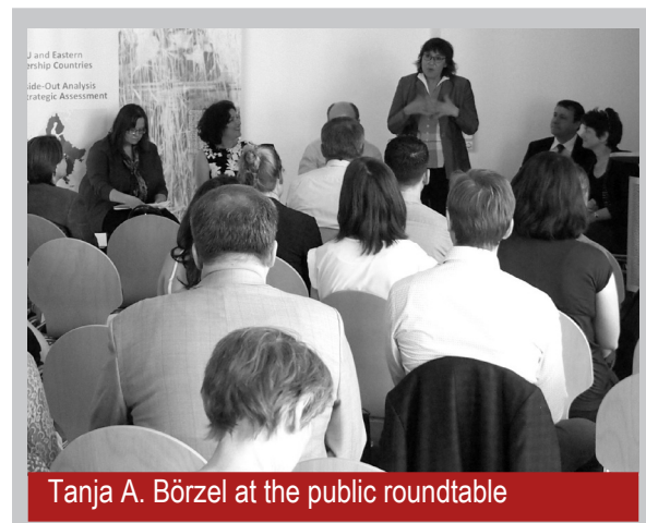
Tanja A. Börzel at the public roundtable

try can formally adopt a large variety of changes, but in order to function properly, they must be in the country's interest in the first place; as seen in the case of anti-corruption reforms in Ukraine. Instead, coherent support to reformists within a country's political and administrative apparatus was key, also to allow elites to show themselves as being successful.