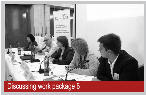
Discussing work package 6

During the opening conference it was stressed that the diversity of instruments that the EU employs remains a challenge for mapping them coherently. The conference participants and panellists stressed that the question of whether and how the AA impact social orders in the Eastern neighbourhood was crucial; especially against the background of potentially unrealistic expectations of the Agreements as representing ‘quick fixes’ for crisis-ridden neighbours.